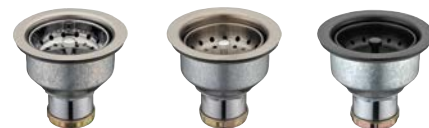
Deep Cup Basket Strainers