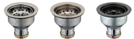
Deep Cup Basket Strainers