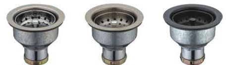
Deep Cup Basket Strainers