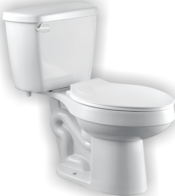
Toilet Seat not Included