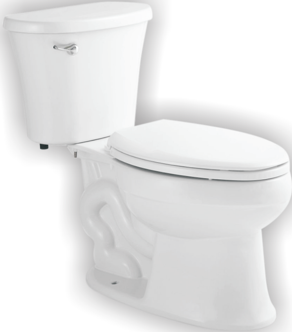
Toilet Seat not Included