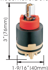
Cartridge (Type F) Model No.: 892-6159

Technical Support: warranty@cmiproduct.com Hour of Operation: Mon - Fri 8:30 a.m - 5:00 p.m. EST