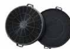
Charcoal Filters (Set) For Use With Recirculating Vent